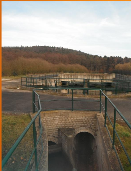
Photo. Rainwater treatment facility, Prague